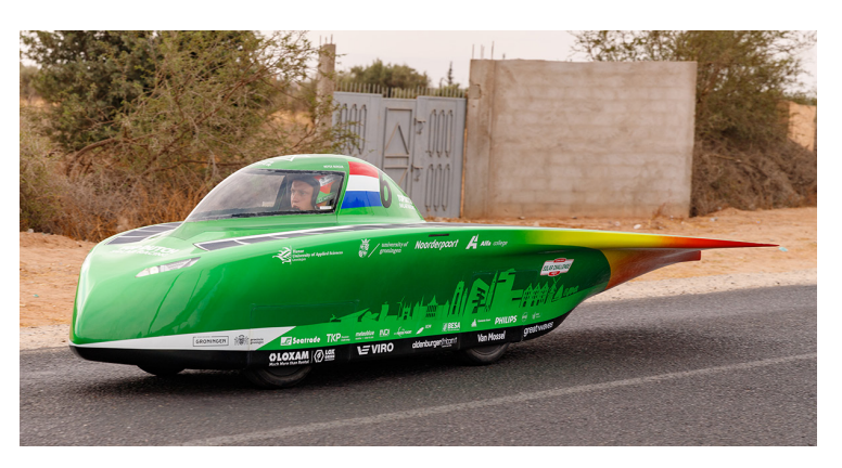
The solar car Green Spirit in Morocco.

Simulation also allows TDSR to improve on design concepts introduced in previous editions while ensuring that all regulations are being followed. By using software provided by Ansys every year, the team can improve their SPEV edition after edition.